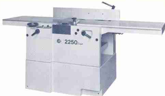
Art. 2188 Combined surfacing and thickening planers Mod. "2250"