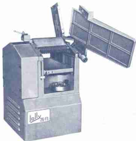
Art. 2190 Planer-thickener - Mod. "JOLLY 260"