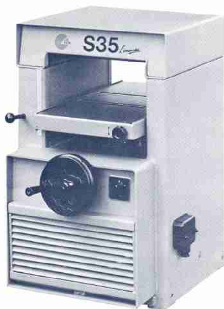
Art. 2176 Thickening planer - Mod. "S35"