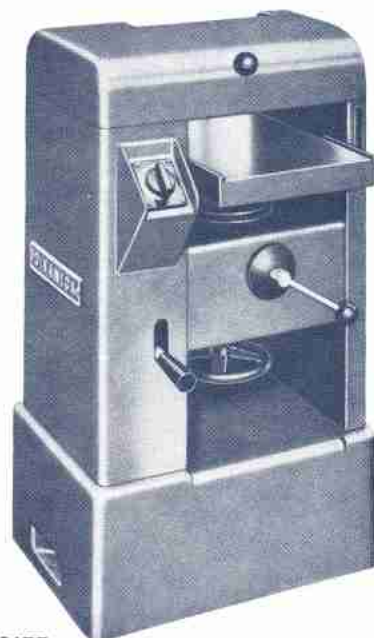
Art. 2177 Thickening planer - Mod. "dinamica 250"