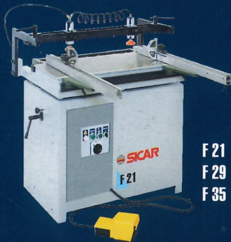
F 21 F 29 F 35