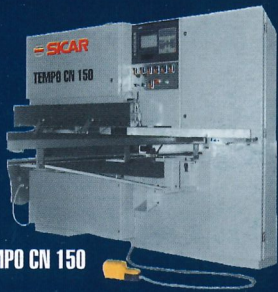
TEMPO CN 150