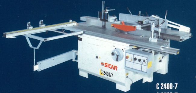
C 2400-7 C 2500-7