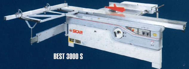
BEST 3000 S