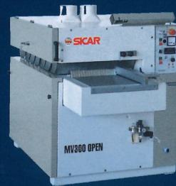
MV 300 500