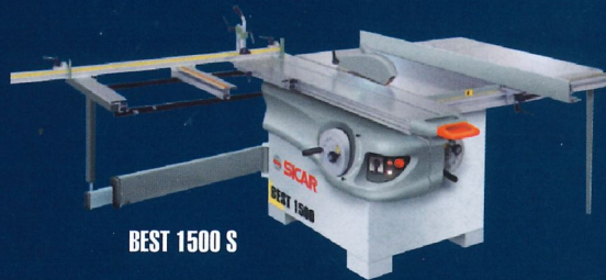
BEST 1500 S