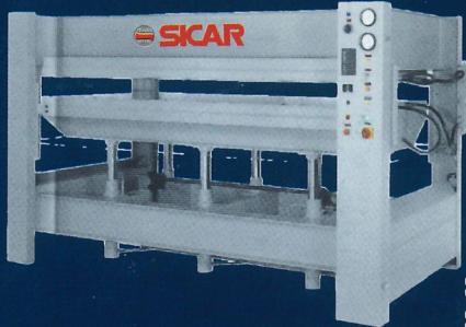
S 65 E S 85 E S 120 E S 150 E