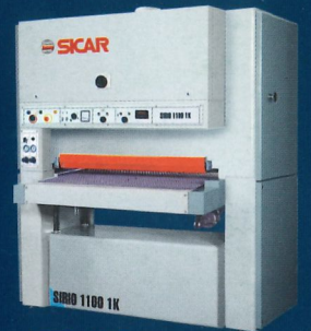
SIRIO 1100 1K SIRIO 1100 2RR