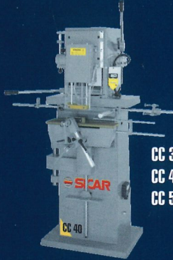
CC 30 CC 40 CC 50