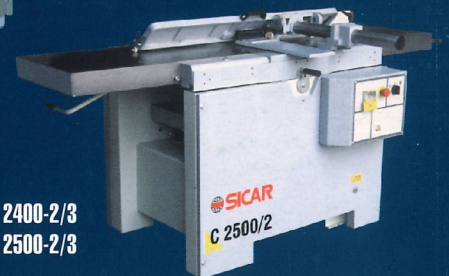
C 2400-2/3 C 2500-2/3